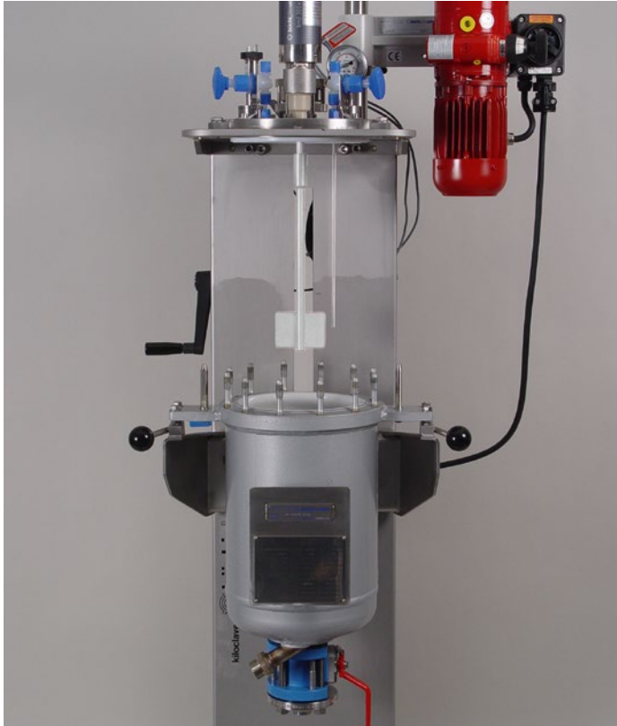
10 liters kiloclave, 6 bar, 180 °C ceramic stirrer drive and stirrer, ATEX

Wetted parts: glass lined steel, ceramic, PFA, PTFE, (PEEK)