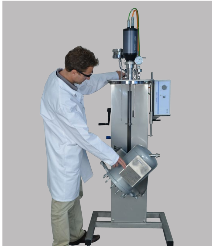
10 liters kiloclave, 60 bar, 200 °C non-EX stirrer drive (ceramic) Tantalum gassing stirrer

Wetted parts: glass lined steel, ceramic, Tantalum, PTFE