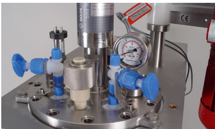
PTFE or PEEK cover plate with PFA valves